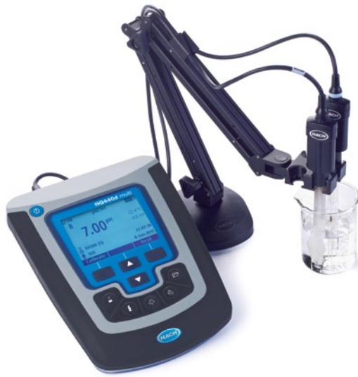
HQD benchtop multi-meter